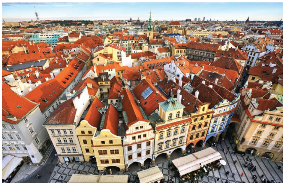
Prague, location for the Annual Meeting of the ETC Market Intelligence Group (MIG) and the Marketing Group (MKG).

The Annual Meeting also featured a special session for the new Associate Members of ETC, who shared their business intelligence as well as practical