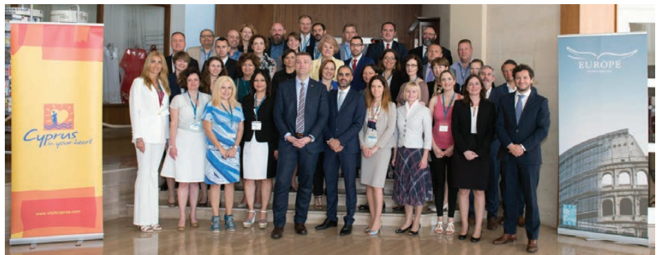
ETC members attending the General Meeting #91 in Cyprus on 11th-13th May.

The concept of connectivity encompasses a wide range of issues which affect tourists’ travel choices - the choice between direct flights and connections, frequency of services, accessibility of small destinations to the major European gateways, seasonality, ease of connecting between different carriers and choice of destinations available from one’s closest airport(s). It also interrelates with a broader range of issues such as security,